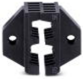
Spare die, for CRIMPFOX 50R

Replacement die - CRIMPFOX 50R/DIE - 1212042