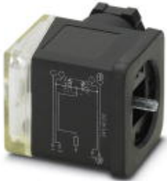
Valve connector, 5-pos., construction A for pressure switches, 2 LEDs, without protective circuit, screw connection, M16 cable gland

Please be informed that the data shown in this PDF Document is generated from our Online Catalog. Please find the complete data in the user's documentation. Our General Terms of Use for Downloads are valid ( http://download.phoenixcontact.com )