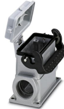
Photo shows product without screw connection

http://eshop.phoenixcontact.de/phoenix/treeViewClick.do?UID=1771176