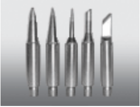
Replacement Soldering Tips H Series