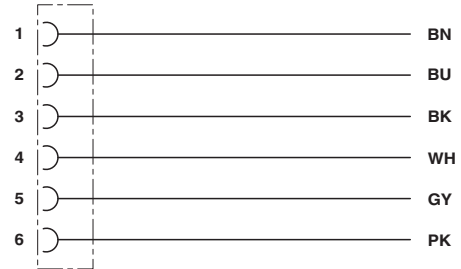
Contact assignment of the DEUTSCH DT06-6S