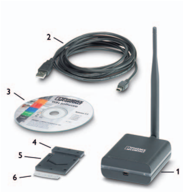
Figure 1 Elements within the scope of supply